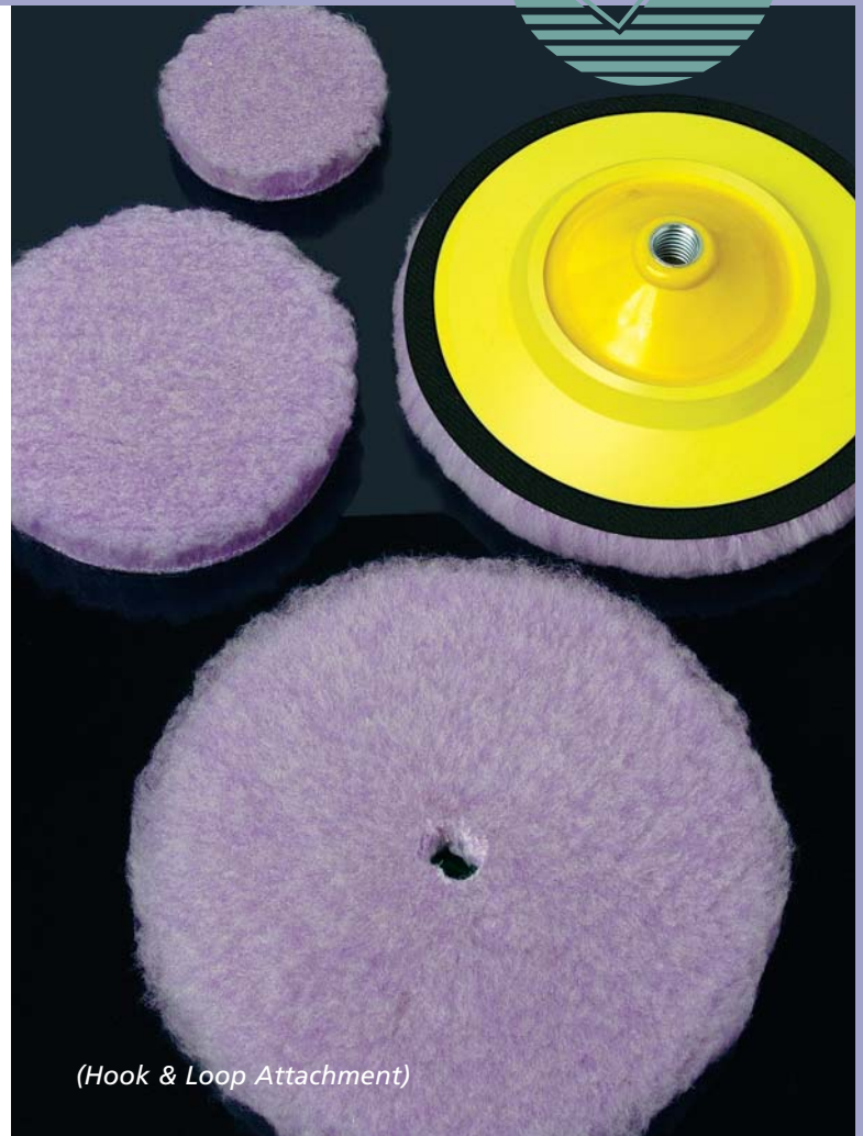
(Hook & Loop Attachment)